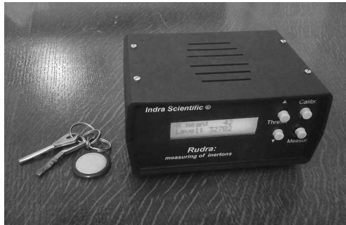
Fig. 1. Spectroscopic device Rudra-1 that measures inertons (designed in 2011).

Small spectroscopic devices, which are prototypes of a future inerton observatory, were designed by our team for measuring inertons at laboratory and field condition (Fig. 1 and 2). It was found that at natural field conditions on the surface of the Earth, the number of signals recorded by the device depends on the orientation of the antenna and the current position of the sun. By using the devices shown in Figs. 1 and 2 we already measured the Earth's inerton field (in a range of frequencies 1 to 100 kHz) and the influence on it from a flux of solar inertons.