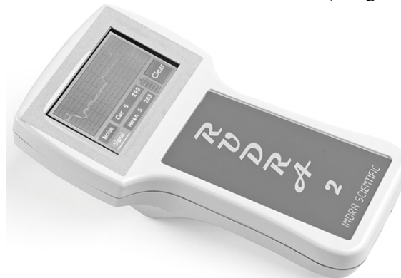
Fig. 2. Spectroscopic device Rudra-2 with more modern design and electronics, which measures inerton signals (designed in 2018).