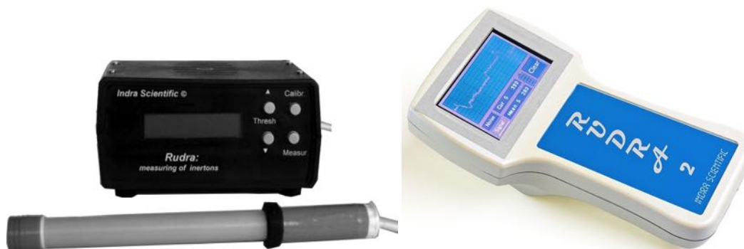
Fig. 1. Rudra (2011) and Rudra-2 (2018) devices for measuring inerton signals. The appropriate software allows us to decode the received signals and build a spectrum in a range from several Hertz to 100 kHz.

Fig. 1 and 2 show devices designed by our R&D team for measuring inerton signals.