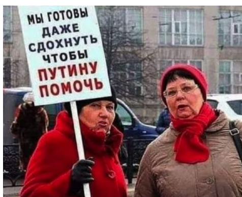
Picture from Muscovy of March 2022: “We are even ready to die to help Putin”

Leading Muscovite writers and cultural figures of the 19th and 20th centuries noted that Muscovites themselves were extremely rude, deceitful, and prone to destruction.