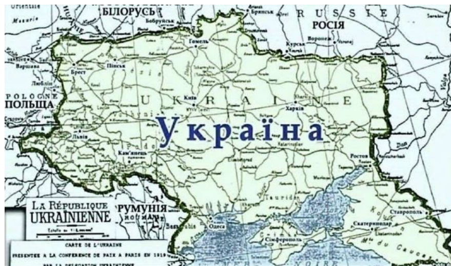
Map of Ukraine in 1919.

In order to stop Russia's attack on Ukraine, it is necessary to go beyond purely materialist views and adopt knowledge from the field structure of the world. Maps of Ukraine for 1919 show that the eastern border was significantly shifted to the east compared to today and the border completely covered all ethnic lands of Ukraine. In fact, the territory of Ukraine reached the Don River, behind which the so-called Russia (i.e., Muscovy) had already begun. The Don River used to be the border between Europe and Asia.