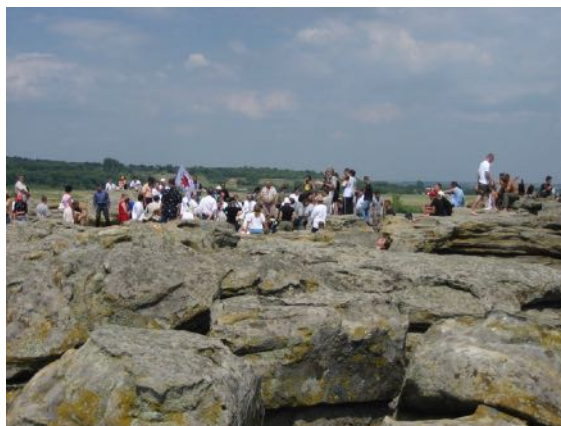
The Stone Grave (before the war unleashed by the Muscovites).

The Arattan commune culture rested on a figurative-intuitive perception of the world, which subconsciously brought culture to an information field (i.e. the all-powerful, all-